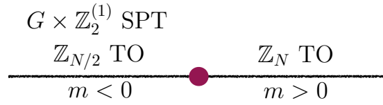
Figure 2: Schematic depiction of the phase diagram of PSU(N) = SU(N)/\mathbb{Z}_N adjoint QCD, Eq. (43), for N even and N_f odd flavors of Majorana fermions as a function of the mass m . The m > 0 phase spontaneously breaks the full \mathbb{Z}_N^{(1)} magnetic one-form symmetry at low energies, giving rise to \mathbb{Z}_N topological order described by BF theory at level N , Eq. (22). For m < 0 , the low energy physics is described by Eq. (51). The \mathbb{Z}_N^{(1)} magnetic one-form symmetry, is spontaneously broken to \mathbb{Z}_2^{(1)} , resulting in \mathbb{Z}_{N/2} topological order. Additionally, the m < 0 phase is stacked with a nontrivial fermionic SPT for the unbroken \mathbb{Z}_2^{(1)} and G = SO(N_f) \times \mathbb{Z}_2^T symmetries. The G symmetry may be fractionalized on the point-like anyon excitations of the bulk topological order in the m > 0 phase. These different choices of symmetry fractionalization in the m > 0 phase are correlated with the particular G \times \mathbb{Z}_2^{(1)} SPT order realized in the m < 0 phase.