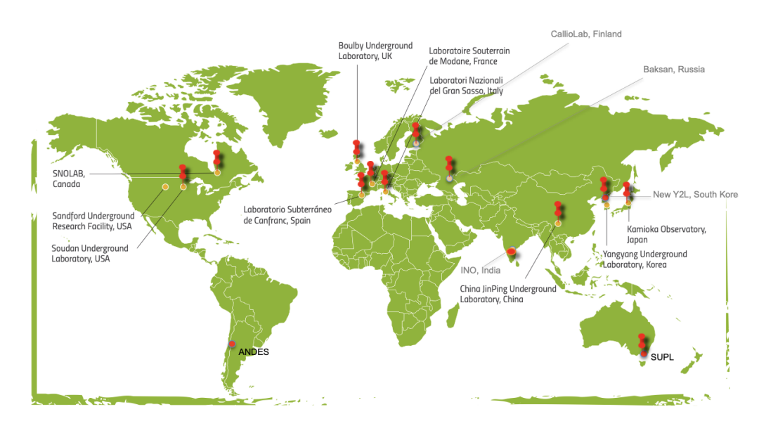
Figure 1: Deep underground laboratories around the world. Red thumbtacks correspond to underground laboratories discussed in this paper. Dots correspond to other laboratories and proposed projects.

Underground laboratories have many common features and at the same time they also have different specific characteristics (e.g. varying depths, geological compositions, laboratory sizes, access capabilities and support services provided) that make them more or less suitable for specific activities. For example, Boulby in the UK has surrounding geology that results in a particularly low ambient radon level underground; Canfranc in Spain and CallioLab in Finland have access to sites at different depths allowing studies with a different muons background level; JingPing in China and SNOlab in Canada are very deep with a significant reduction of the locally muon-induced background.