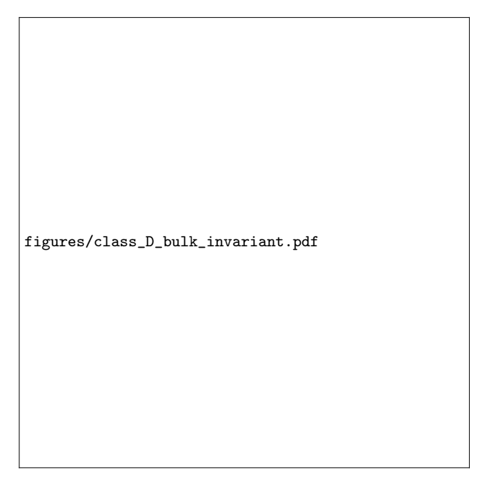
Figure 5. Topological phase transitions of the amorphous class D model as a function of the chemical potential. (a) Density of states of a finite amorphous sample. Darker color indicates higher density. (b) Spectral function at \mathbf{k} = \mathbf{0} of a finite amorphous sample. The spectrum of the effective Hamiltonian is overlaid in red. (c) Same as (b) but at \mathbf{k} = \infty . (d) Topological invariant \nu_M (solid line). The dashed and dotted lines correspond to sign[pf H_+^{\text{eff}}(\mathbf{0}) ] and sign[pf H_+^{\text{eff}}(\mathbf{\infty}) ] respectively, offset along the vertical axis for visual clarity.